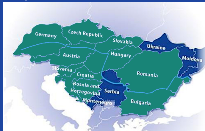
INDEED Project countries (green area)

INDEED aims to improve the knowledge and skills of all professions involved in dementia care, promote their collaboration and stimulate entrepreneurial engagement for people with dementia. To reach these objectives, a coherent educational and skill-building intervention is developed and tested. The intervention package will be made available to all interested parties in the Danube region.