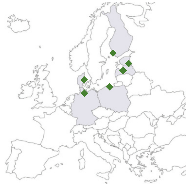
Figure 2: Pilot cities