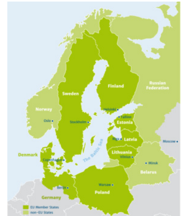
Figure 1: Programme area, www.interreg-baltic.eu